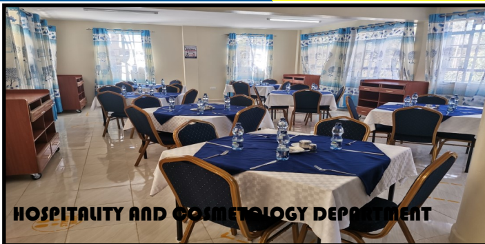
HOSPITALITY AND COSMETOLOGY DEPARTMENT